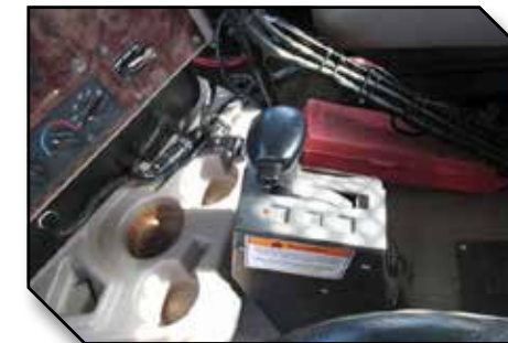
Figure 8 - Floor Mounted Control Tower

8. Insert a hook up through the hole in the right rear corner of the driver side floor mat. The hook should fit flush with the underside of the floor mat.