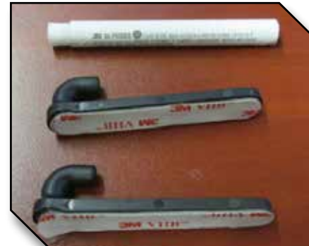
Figure 6 - Driver Side Electrical Enclosure & Floor Mat

7. Install the center mat in the truck and verify fit. In some cases the center mat will need to be trimmed on the left side to allow for a driver seat with a large base plate. Specifically, trimming is required when using with the "Minimizer Long Hall Series seat". There is a raised rib molded into the center mat that is designed to be used as trim guide. The area shaded in blue on Figure 7 below is the area to be trimmed.