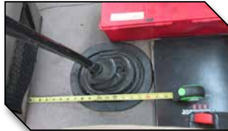
Figure 3 - Distance Measured from Doghouse to Gearshift