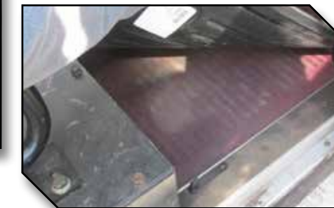
Figure 11 - Passenger Mat Hook in Position

18. Confirm that the retention hook is fully engaged into the driver mat and that the hook is adhered to the floor. If the driver mat retention hook is not functioning properly or the mat cannot be securely installed, do not use a Minimizer floor mat on the driver side of the vehicle.