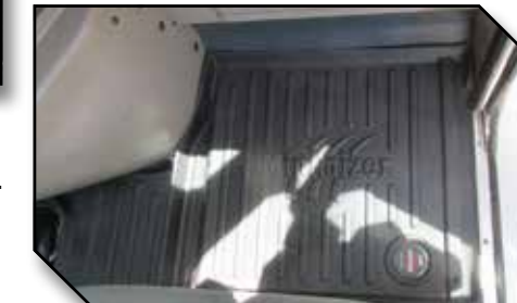
Figure 10 - Passenger Mat in Position

17. Use the same process listed in steps 7-14 above to attach the passenger mat retention hook to the floor. Follow the same basic steps to prime the surface and attach the hook to the floor of the cab as shown in Figure 11.