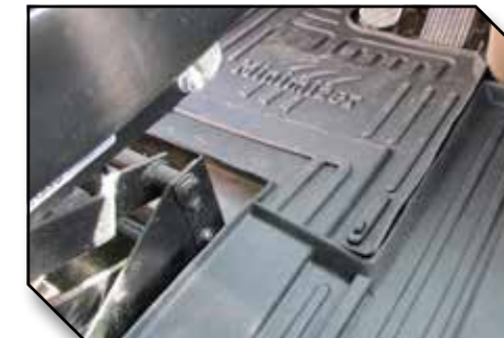
Figure 9 - Driver Mat Hook in Position

Mark the approximate position where the hook needs to be attached to the floor. Once the position is located, remove the driver mat from the truck.