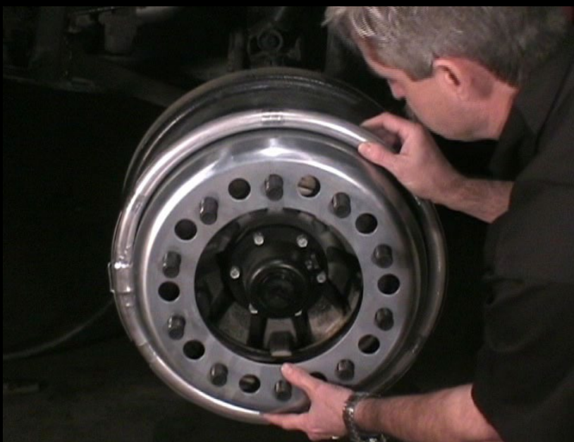
Install the balancer making sure the balancer fits flush over the drum, aligning studs in proper hole.