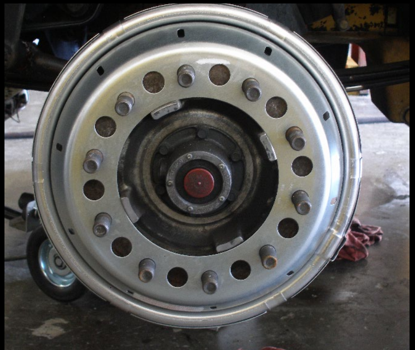
Balancer during installation