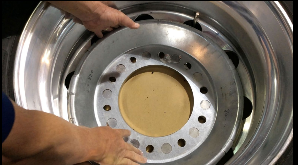
Place the balancer inside the rim, and make sure that it doesn't touch the valve stem and lays flush in the wheel.