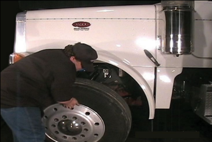
Remove the wheel