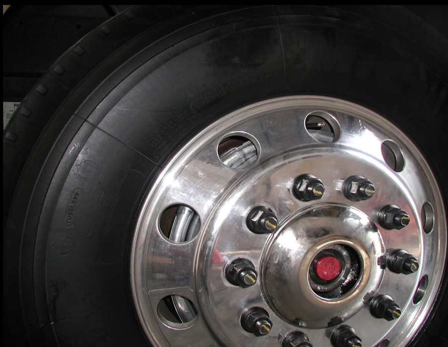
Balancer After installation